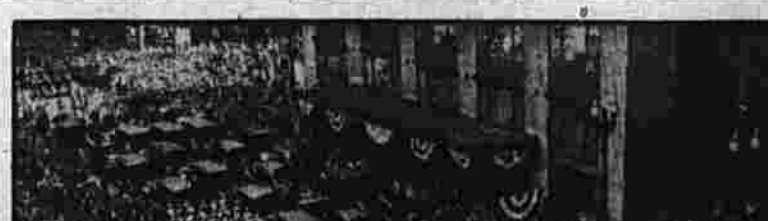
Roman Catholics from every section of the nation and thousands of Cleveland, O. residents jammed all downtown streets in the vicinity of the Union Terminal, opening the seventh annual Eucharistic Congress.